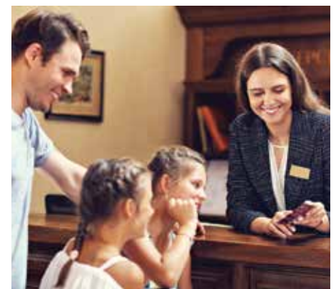
A family checking into a hotel.