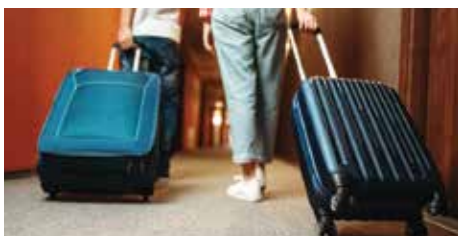
Hotel guests with luggage.